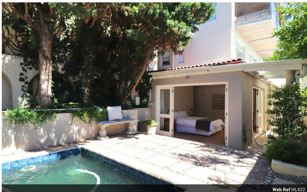
Web Ref HL422

106 Old Cape Quarter Building, 72 Waterkant Street, De Waterkant, Cape Town 8001