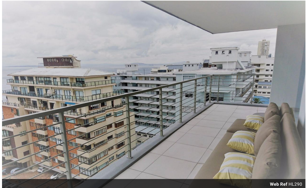
Web Ref HL290

106 Old Cape Quarter Building, 72 Waterkant Street, De Waterkant, Cape Town 8001