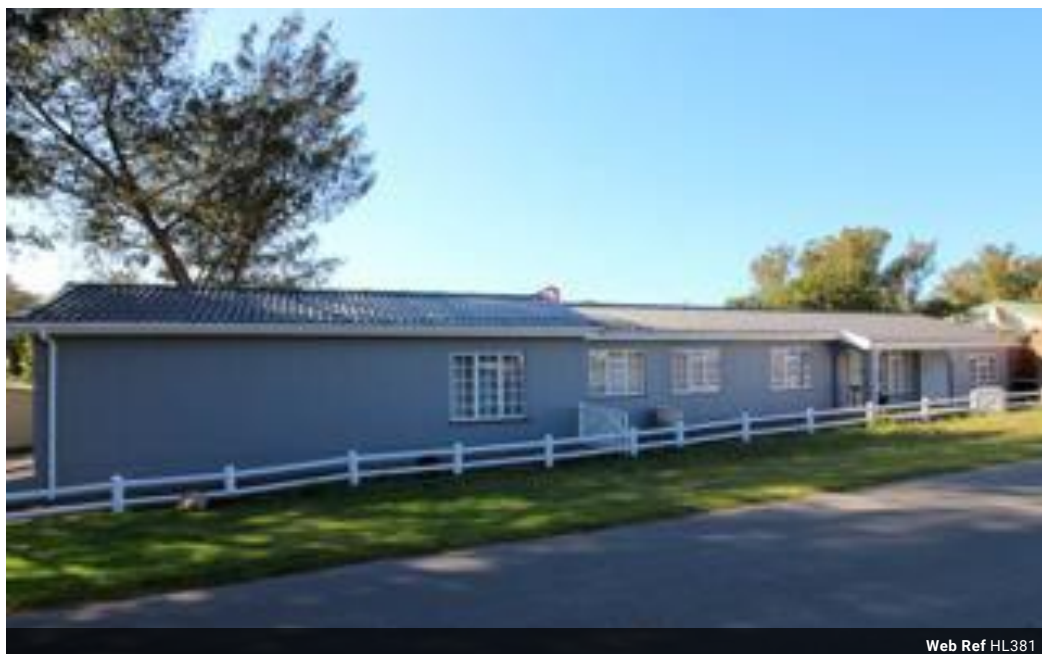
Web Ref HL381