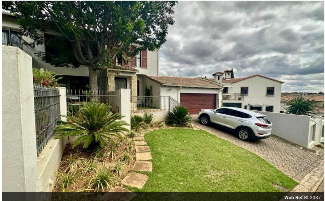
Web Ref RL2037

194 Bancor Avenue, Park Lane West Building, Waterkloof Glen, Pretoria